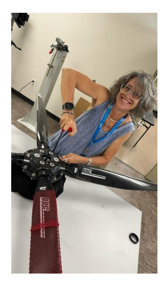
On arrival at OSH 2022

Linda also wanted to have it 'N registered' before leaving South Africa so arranged for a friendly FAA designated examiner to meet them in Johannesburg to carry out the necessary inspections prior to departure. By 3<sup>rd</sup> July 2022 three High Wing Slings one taildragger, the original prototype and Linda's aircraft - were ready to embark on an epic flight across the Atlantic to AirVenture 2022 in Oshkosh.